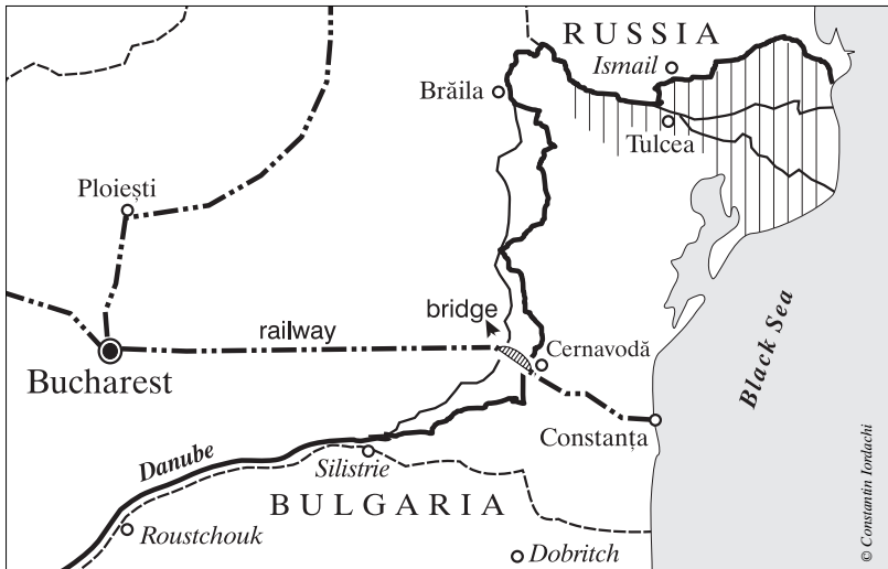
The railway line Bucharest-Constanța, and the Bridge "King Carol I" over the Danube.

tutional reorganization. This process was accompanied by a great political turmoil, marked by territorial losses (Southern Bessarabia), the socio-political upheaval stirred by mass conscription and the country's military participation to the 1877-1878 war, and, eventually, by the European diplomatic intervention in favor of the political emancipation of Jews in Romania. This peculiar timing of the annexation of Dobrogea had important consequences for shaping the patterns of the integration of the province into Romania. Dobrogea was the first major test of Romania's national institutions and power of assimilation, which explains the importance assigned by Romanian political elites to administrative centralization and cultural homogenization in the province. Finally, the end of the separate administrative regime in Northern Dobrogea in 1913 was an indication that the assimilation of the province produced satisfactory results: in only 35 years (1878-1913), Dobrogea was nationalized by a growing Romanian ethnic majority. In addition, massive economic investments developed the province into "the most shining diamond on King Carol's crown," 91 and an indispensable component of the Romanian national economy. Consequently, Dobrogea's integration was celebrated by Romanian political elites as a success, a self-congratulatory evidence of Romania's civilizing power. 92